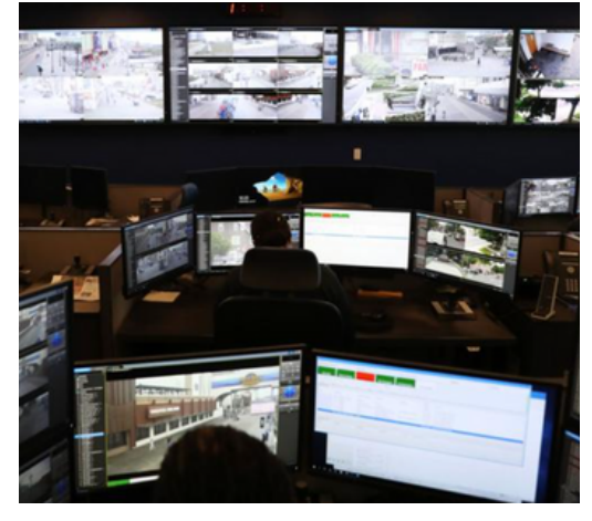
A peek of Atlantic City Headquarters for Intelligence Logistics Electronic Surveillance (ACHILES).

Installing security cameras is just one part of Chelsea EDC's diverse strategy to increase public safety. In fact, just about everything we do is designed to create a safer and more connected neighborhood.